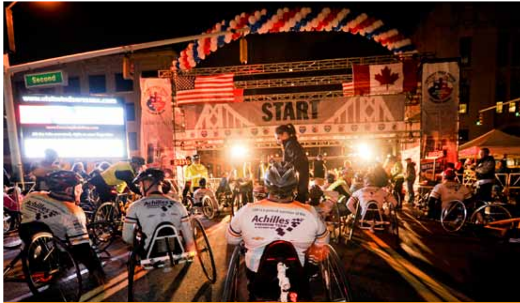
Achilles Freedom Team at the start of the 2011 Detroit Marathon (photo courtesy of Steve Fecht).